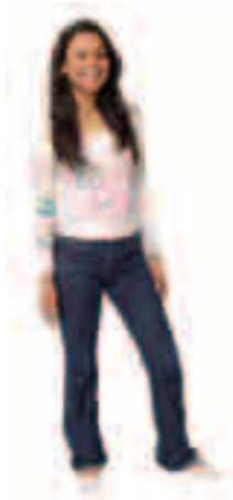
[ 16 ] One-to-One tuition is geared to individuals' needs and pace.