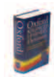
People who use English in their professional lives can take a summer English for Business course.

If you would like to study English for Business at another time, we can arrange a programme of private lessons for you, or lessons with one or two other people.