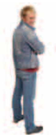
[ 14 ] Subject Studies are taught alongside English native speakers.