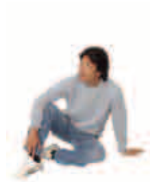
Complementary Studies options give you the opportunity to build your language skills in different contexts and topics.

Subject Studies: Academic subjects at university level are offered on our University Foundation Course and the Advanced Studies Programme. You will have the benefit of studying these subjects alongside native English speakers.