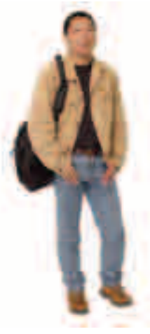
[ 12 ] St. Clare's has prepared students for university entrance for over 40 years.