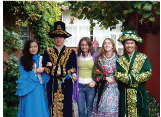
Students in Kazakh costume.

The international educational community of St. Clare's hosted its annual International Day on Thursday the 14th of October 2004. Not only did this memorable event bring closer students from different ethnic and religious backgrounds, but also allowed them to broaden their knowledge on various issues in different parts of the world, whether being political or economic. After a great deal of hard work and effort put into organising an event that was put together by the students themselves, the International Day of 2004 was entertaining, educational and extremely enjoyable!