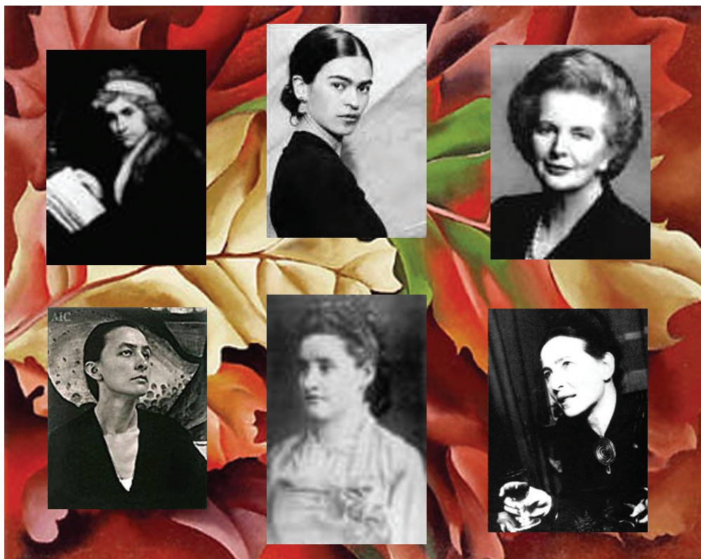
Clockwise from right: Margaret Thatcher, Simone de Beauvoir, Anna O. (Bertha Pappenheim), Georgia O'Keefe, Mary Wollstonecraft, Frida Kahlo.