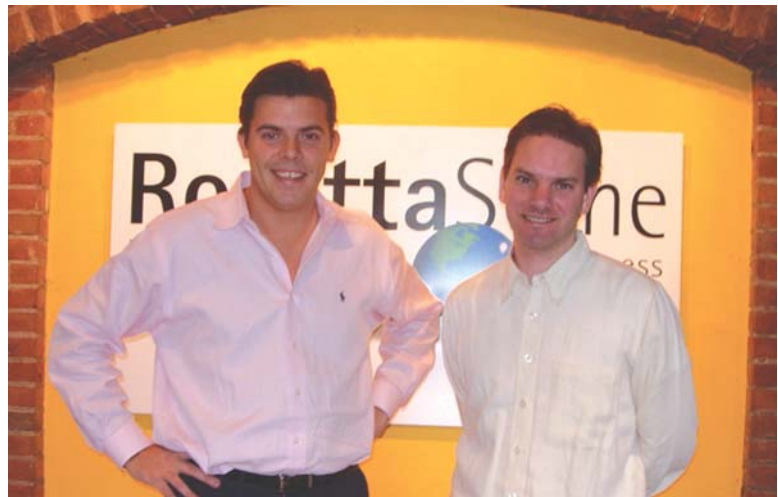
Right: In front of the company logo.