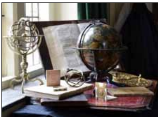
Johannes Schöner's magnificent celestial globe (centre) and other objects featured in the exhibition

The exhibition marks the 500th anniversary of the birth of cartographer Gerard Mercator, whose world map projection we use to this day. Mercator was famed for his pocket globes, and a pair of his splendid terrestrial and celestial globes, lent from the National Maritime Museum, will be