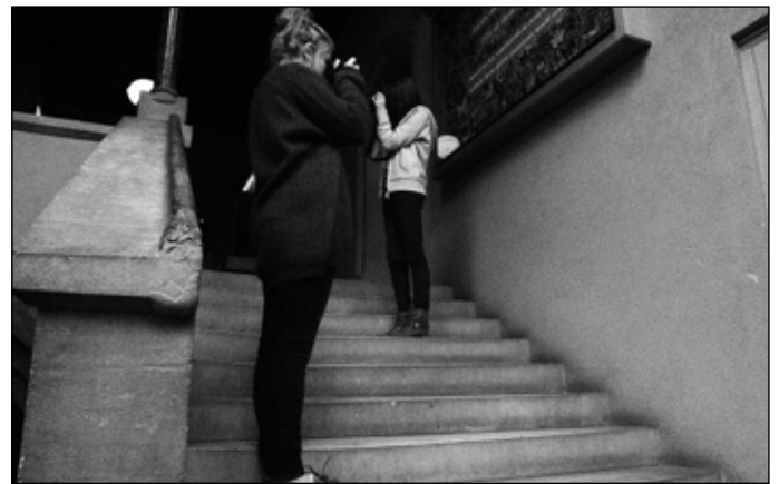
Three images on the theme of 'Pairings', taken by students attending the photography workshop.

The free workshop was led by photography tutor and trainee museum education officer, Scott Billings.